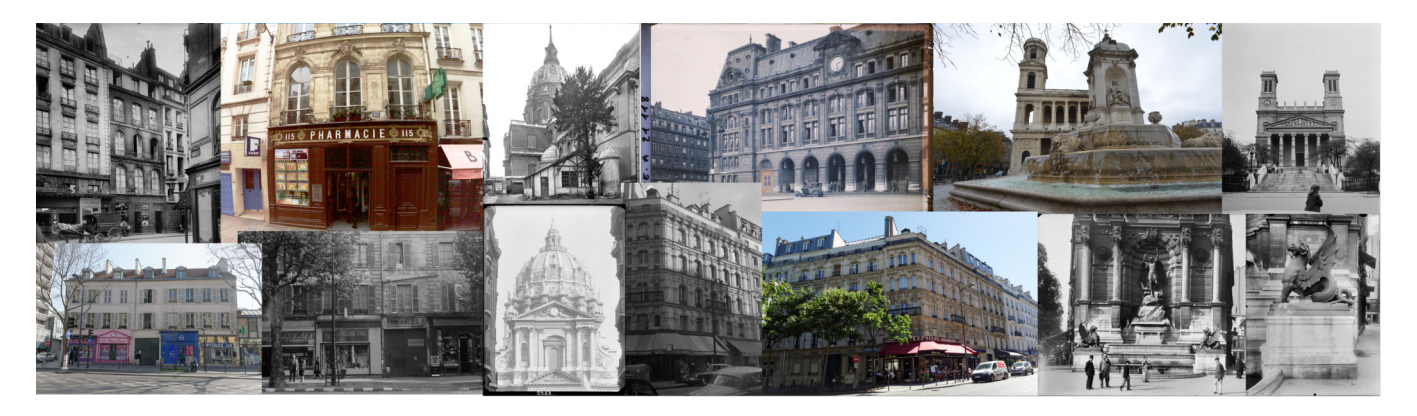
Figure 1: Examples of geographical iconographic heritage<sup>1</sup>

Valérie Gouet-Brunet LASTIG, Univ Gustave Eiffel, IGN-ENSG France valerie.gouet@ign.fr