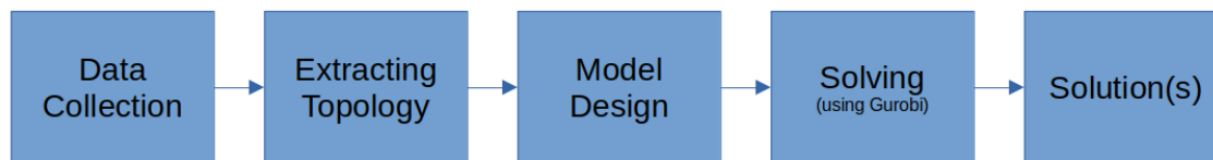
Fig. 2. Operations design

The primary goal of the work is to build a model and use that model to optimize the operation for the targeted missions. A second objective is to show the feasibility of this approach in an industrial context. To achieve the primary goal (Fig. 2), the main goal has subdivided into smaller classic tasks as follows: