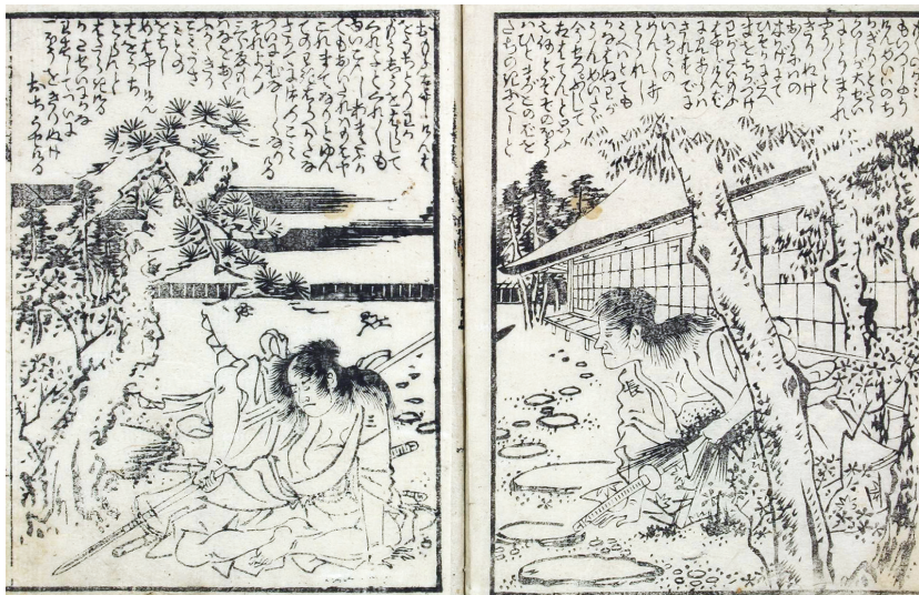
Figure 1. The Sumiyoshimode , as the villain Taema kills the head of the Usami clan. In this kibyōshi tale of vengeance, illustrated by the author, most of the page consists of illustrations, with the text of the tale above. Dialogue would sometimes appear below the illustrations. Jippensha Ikku, Sumiyoshimode , pp. 4 ura , 5 omote .