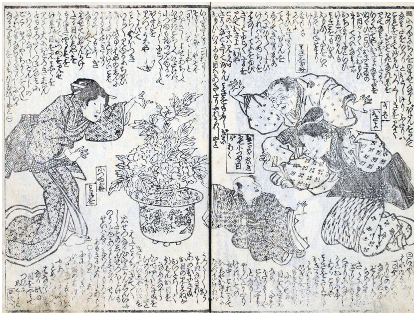
Figure 2. The Teijokagami , showing the moment when Osayo's loyalty enables little Otsuyu, daughter of Hayanoshin, to see a peony for the first time. Illustrated by Utagawa Kunisada, this page shows the characteristics of the gōkan tales. Text and explanatory sections surround the illustrations, which would also contain dialogue boxes. Santō Kyōzan, Teijokagami , volume 3, pp. 1 ura , 2 omote . Courtesy of the Waseda University Library “Kotenseki Sogo Database.”