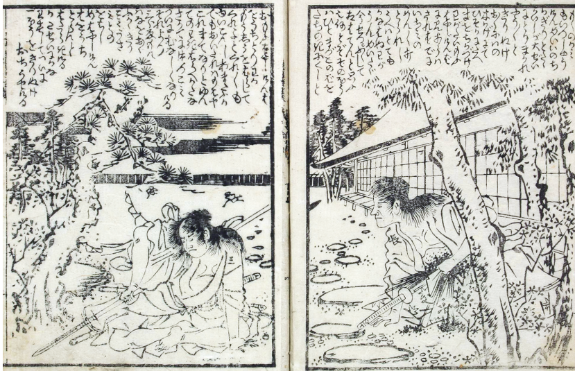
Figure 1. The Sumiyoshimode , as the villain Taema kills the head of the Usami clan. In this kibyōshi tale of vengeance, illustrated by the author, most of the page consists of illustrations, with the text of the tale above. Dialogue would sometimes appear below the illustrations. Jippensha Ikku, Sumiyoshimode , pp. 4 ura , 5 omote . Courtesy of the Waseda University Library “Kotenseki Sogo Database.”