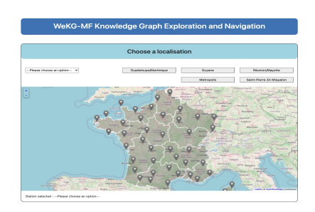
(a) Cartographic visualization and selection of weather stations