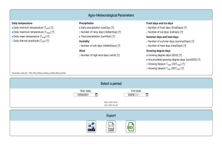
(b) Visual selection of agro-meteorological parameters