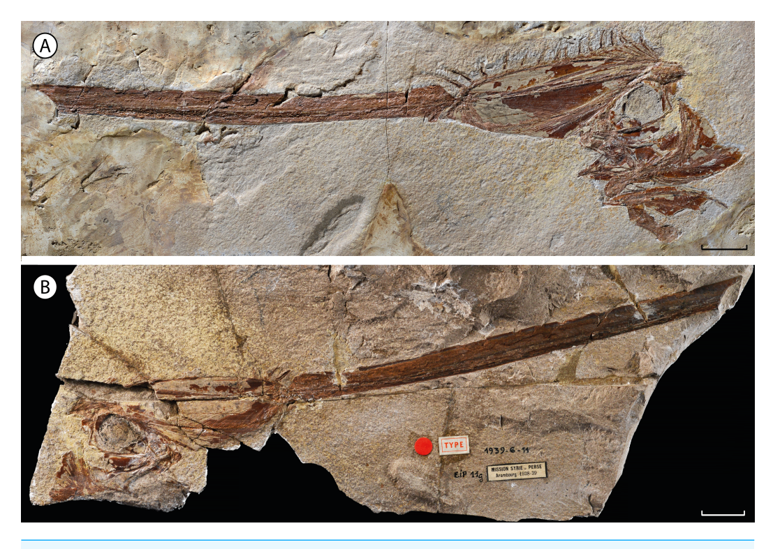
Figure 1 † Babelichthys olneyi , gen. et sp. nov., holotype. (A) MNHN.F.EIP11d. (B) counterpart MNHN.F.EIP11g. Scale bars = 20 mm.

resolved and the associated information viewed through any standard web browser by appending the LSID to the prefix http://zoobank.org/. The LSID for this publication is: urn:lsid:zoobank.org:pub:B677BA4F-CCF4-4678-A8A8-502F059704D2. The online version of this work is archived and available from the following digital repositories: PeerJ, PubMed Central and CLOCKSS.