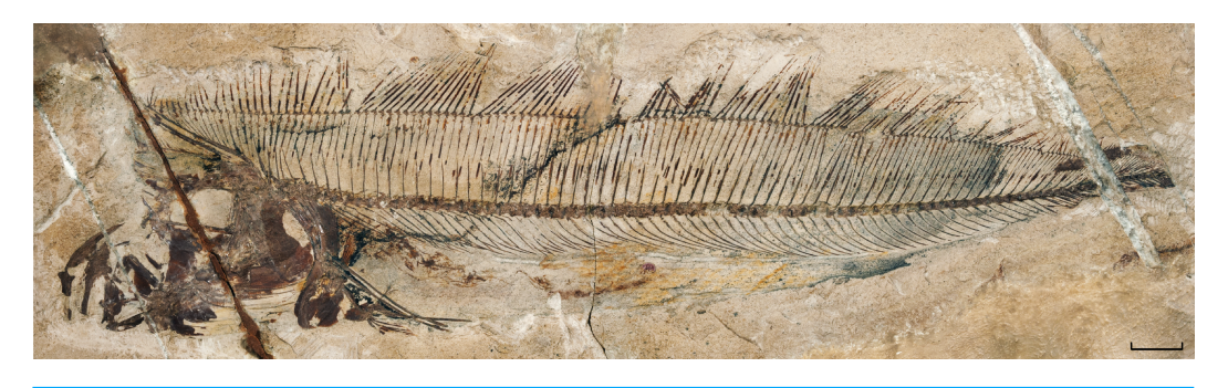
Figure 3 †Protolophotus elami , holotype MNHN.F.EIP10d. Scale bar = 20 mm.