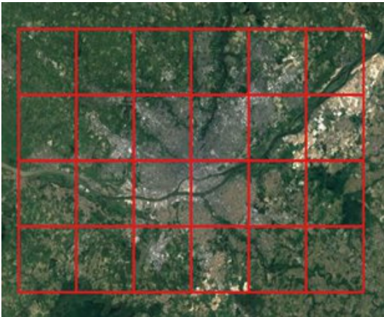
Figure 1. Studied area: the city of Nantes and its surroundings.

The goal of this work is to explore the possibilities offered by multimodal deep learning for cartography applications. Our use case is to detect salient buildings in an existing cartographic database. This could be helpful in order to improve the symbolization of the derived map, or to create automatic routing instructions for example. In this work, we define salient buildings as “buildings that are salient in their environment in real life, and which can be used to give some navigation indications”.