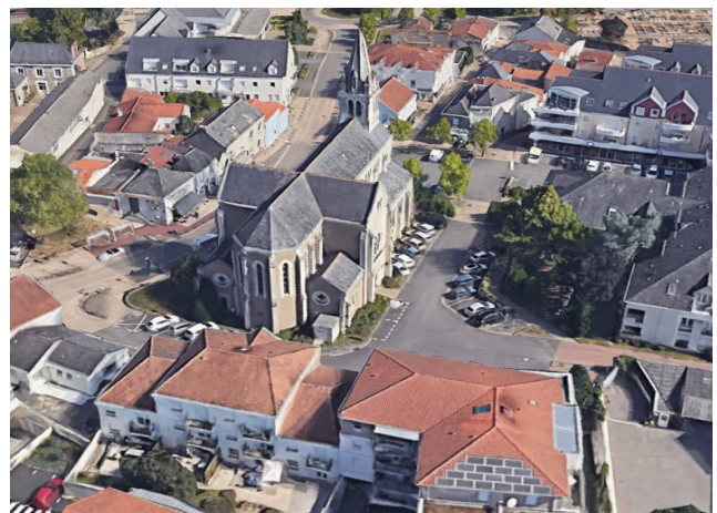
Figure 2. Selected salient building during the database creation (left) and same building on Google Earth (right).