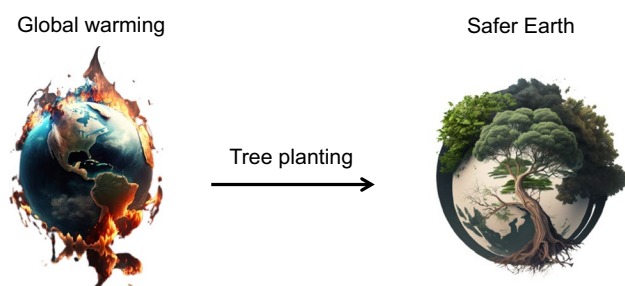
Fig. 1 Effectiveness of planting trees in the forms of afforestation or reforestation and dedicated crops in mitigating climate change