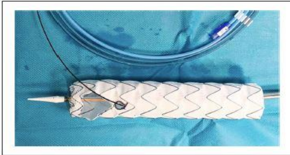
Figure 1. Standard double-fenestrated physician-modified endograft (PMEG) with a preloaded guide through the small fenestration.