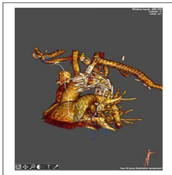
Figure 3. Postoperative 3D reconstruction after homemade double-fenestrated thoracic endovascular aortic repair (TEVAR) and bilateral carotid-subclavian bypass of a patient with aberrant right subclavian artery (ARSA) for isthmus rupture.

This study is the first to report the results of hybrid treatment with physician-modified fenestrated endograft and tries to clarify the value of this approach in terms of feasibility, morbidity, mortality, and medium-term outcomes.