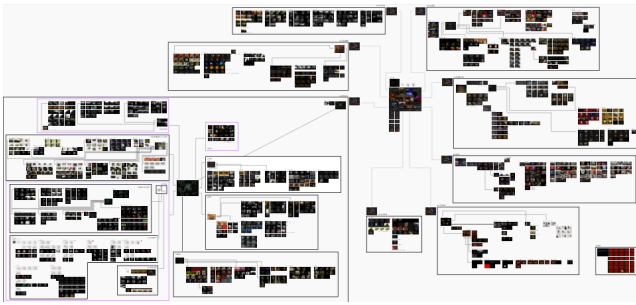
Figure 6. A preview of the map of the full Immemory tree structure including all its images sorted by sections and sub-sections.

program) are archived together with schemes of all clickable areas in each of them.