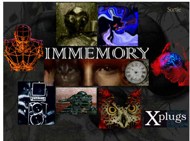
Figure 1. Immemory 's main menu, leading to each of its sections. Image capture extracted from the original program.

How can the museum deal with historicization of interactive artworks? Can the exhibition and documentation of these artworks stay truthful both to the experience they intended to provide and to their historical evolution when they have gone through many transformations?