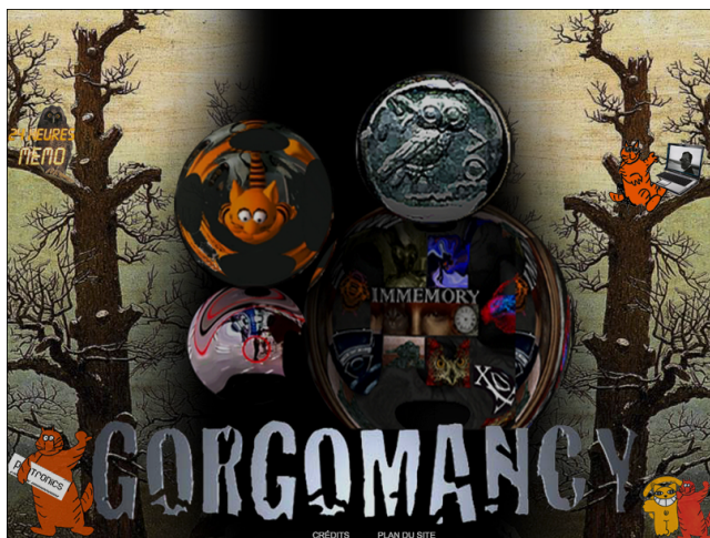
Figure 3. Screen capture from the home page of the website Gorgomancy as released in 2013

The biggest change is certainly its migration on the web as an online browsable work that was produced between 2007 and 2013, officially releasing one year after Marker passed away in 2012. Produced as a part of Marker's website project with Centre Pompidou Gorgomancy (itself an archive of various works by Marker – including, among others, The Owl's Legacy , the Poptronics montages and Immemory ), the original program for CD-ROM created on HyperStudio was entirely re-coded in Flash during this period, with the goal of preserving its original look and feel, but with important technical changes nonetheless: all the tree structure was rebuilt from scratch, many of the animations re-created to fit the Flash format, and mostly, all the images were upscaled to a more fitting image definition for newer monitors, of 900x675 pixels (instead of the original 640x480 pixels) and converted into Jpegs 3 . This change, partly due to technical contingencies from the mid-2000s, resulted in visual artifacts that are noticeable when comparing the two versions of the images (typically blur, loss in color saturation and sharpness), generated both by the upscale interpolation to enlarge the original images and by the Jpeg compression to make them lighter for an online use.