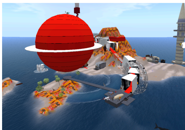
Figure 2. Screen capture of the Second Life installation Ouvroir .

Marker prolonged with Immemory his approach of installation in a computer-based self-contained form, building within it a similar dialogue between all types of media, from photographs to electronic images. The physical movement of the viewer walking around the video monitors and computers as seen in 1990 in Zapping Zone was transposed to a virtual navigation through point-and-click interaction inside the CD-ROM structure, following the same idea of an invitation into Marker's imaginary museum. In his own words, "the reader-visitor can imperceptibly come to replace my images with his, my memories with his, and that my Immemory should serve as a springboard for his own pilgrimage in Time Regained ." [3]