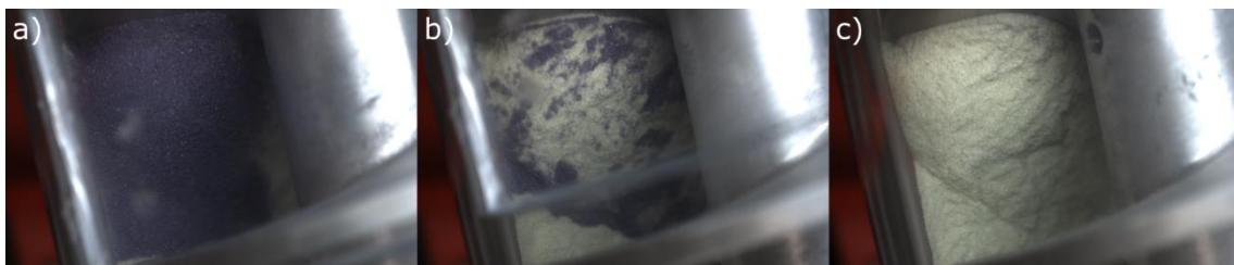
Figure 1: Images of the heap surface a) at the beginning, b) in the middle and c) at the end of the measurement

Screw reactors are largely used devices in the industry. Few studies focus on the powder hydrodynamic in these reactors and even fewer at a local scale. Knowing the exposure time of the bed to the gaseous atmosphere is crucial to understand gas/solid mass and heat transfer. Therefore, a simple method is proposed to measure this parameter. The heap surface of one pitch is sprinkled with the studied powder colored in blue (Figure 1a). An optical device, moving at the screw speed, was developed in order to focus on the sprinkled heap surface. Therefore, the camera follows the renewal speed of this surface during the screw rotation (Figure 1b and c). Using an image processing code, the blue proportion on the heap surface is determined over time, giving the heap surface renewal speed.