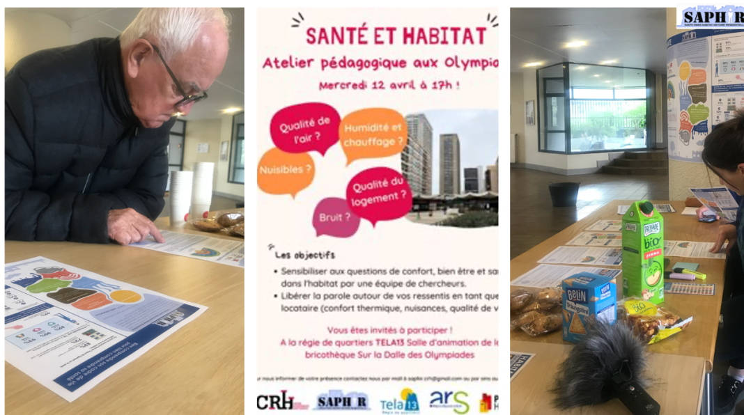
Figure 1 Workshops and posters produced, interaction with the inhabitants.

This research program, supported by the Agence Régionale de Santé Île-de-France , aims to answer these questions. It is based on a sample of 12 buildings in eastern Paris and its northeastern suburbs, according to year of construction (and therefore of compliance with standards, particularly thermal and acoustic), physical density, location in the city, access to services, occupancy status (condominiums, social housing) and population type (age and income brackets).