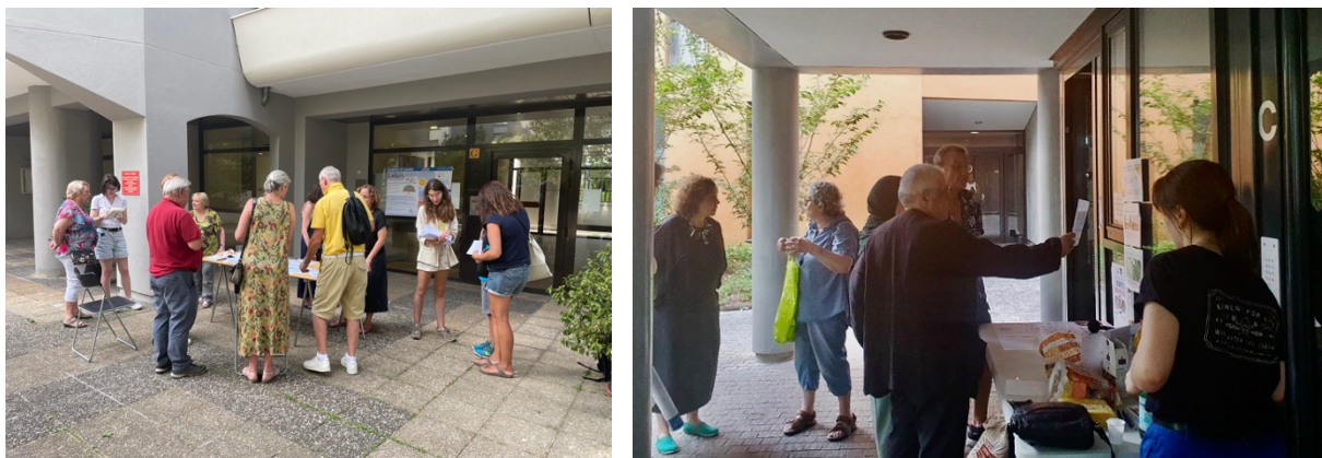
Figure 4 Focus Group in Paris, 2023

Focus Groups are held in each building. These meetings are used to draw up a collective diagnosis and assessment of the quality of housing in terms of health. These are inserted into the history of the building and its residents: plans of the building, the apartments and their reorganization by the residents are mobilized.