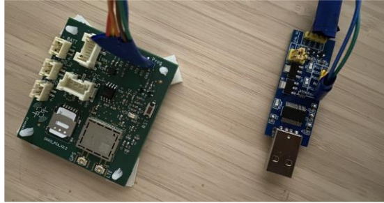
Figure 2. Assembly for uploading Arduino code to the OKKO board.