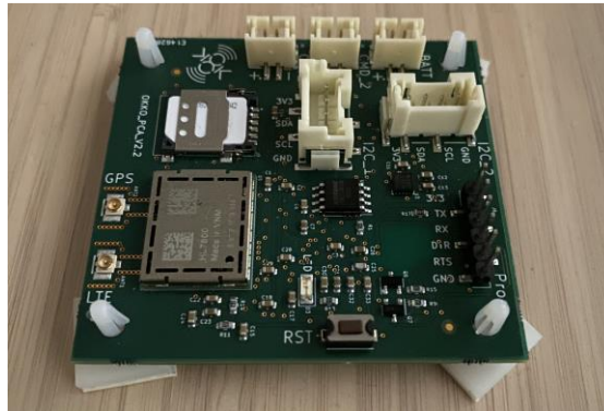
Figure 1. The OKKO board: ESP32-S2 microcontroller + HL7800 LTE-M modem + I2C connectors.

The ESP32-S2 microcontroller used for this project is a customized version which presents a few differences from the standard models, particularly in terms of the number and limitation of programmable pins. This particularity meant that our codes had to be adapted to take account of this constraint. In addition, we have found that the command return terminal can sometimes have uncontrollable character inversions or deletions. We had to deal with this problem when implementing certain functionalities, such as setting up a monitoring and connection recovery system in the event of signal loss. Despite these constraints, we succeeded in overcoming these difficulties by carefully analyzing the feedback from the terminal and adapting our codes to take account of it. We thus worked to achieve two key objectives: the transmission of data via TCP requests, then the sending of HTTP requests to an external Cloud server.