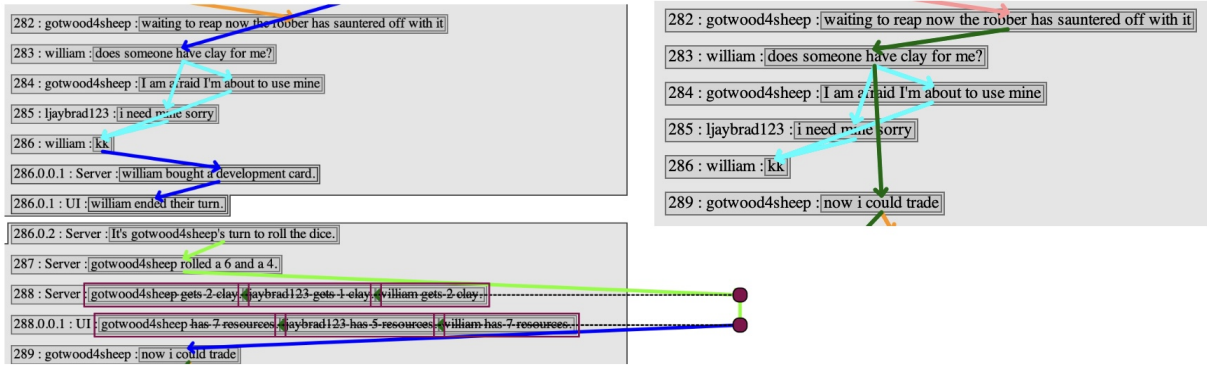
Figure 2: An example from STAC. On the left, we see the full interaction, from S - Sit , that contains both chat and game moves. On the right, we see the version from S that contains only the chat moves.