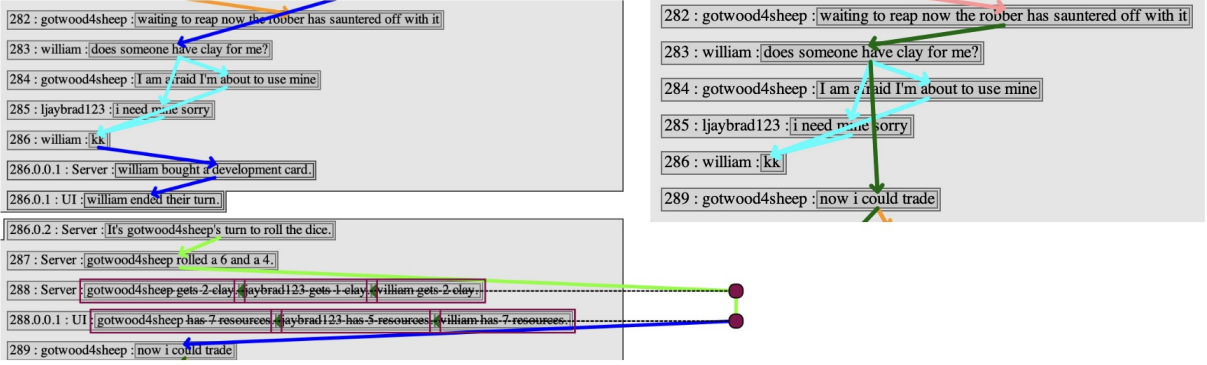
Figure 2: An example from STAC. On the left, we see the full interaction, from S - Sit , that contains both chat and game moves. On the right, we see the version from S that contains only the chat moves.