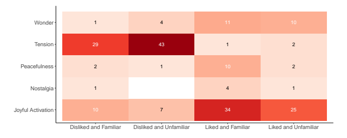
Figure 3: Distribution of the emotional contexts relatively to the liking judgment and familiarity of the corresponding tracks.

Regarding the impact of valence and arousal on the emotional context, we undertook similar tests with the values obtained from the SAM model. The corresponding analyses generally led to the same conclusion, except for the relationship between arousal and familiarity for which we found no statistically significant correlations.