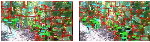
Fig. 4. Example of detection using the combined data fusion and YOLOv5m network trained with RGB images (left) and with RGB-D images (right).

Fig. 4 represents an example of the output of the combined data fusion and YOLOv5m network trained with RGB images only, and with RGB-D images. The red, green and blue boxes are respectively the leaves, the grapes, and the branches classes.