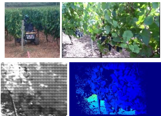
Fig. 1. Top-left: Summit XL mobile robot instrumented with the multi-sensors system; Top-right: RGB image; Bottom left: MS image; Bottom right: Depth image.

In this study, a multimodal acquisition system was developed to acquire vineyard data in several modalities. It is composed of a SILIOS CMS-V multi-spectral camera sensitive to eight different wavelengths bands from 550 to 830 nm and of a Microsoft Kinect V2 camera for RGB and depth information. Both cameras have been mounted on a Summit XL mobile robot as shown in Fig. 1 for ease of acquisition in a vineyard field which can have an irregular or an uneven shape. The positions of the cameras on the robot have been carefully chosen for accurate capture of the fine details of the scene, i.e., leaves, branches, and berries. Also, the cameras are fixed on the mobile robot so that their relative positions are perfectly known and do not vary during acquisition.