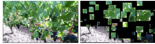
Fig. 3. Example of a labeled image processed to clear out no labeled regions. Vineyard RGB images (left) and Image with no labeled regions clear out (right).

Three training and test cases have been considered using two Deep Learning architectures: a Data Fusion network that we have defined and the YOLOv5m, a medium size YOLOv5 network, with the Ranger optimizer and pretrained with the MS COCO dataset. We have used and compared both the Adam and the Ranger optimizers [16]. Finally, we have chosen the Ranger optimizer, which is a combination of RADam and Lookahead, because it offers improved training efficiency, faster convergence, and better performance compared to Adam. The three cases are: