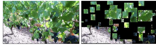
Fig. 3. Example of a labeled image processed to clear out no labeled regions. Vineyard RGB images (left) and Image with no labeled regions clear out (right).

Three training and test cases have been considered using two Deep Learning architectures: a Data Fusion network that we have defined and the YOLOv5m, a medium size YOLOv5 network, with the Ranger optimizer and pretrained with the MS COCO dataset. We have used and compared both the Adam and the Ranger optimizers [16]. Finally, we have chosen the Ranger optimizer, which is a combination of RAdam and Lookahead, because it offers improved training efficiency, faster convergence, and better performance compared to Adam. The three cases are: