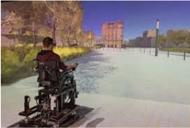
photograph of the power wheelchair

This PWC simulator is composed of three connected parts: the platform moving at four degrees of freedom (pitch, roll, yaw, and heave) composed with a Quickie salsa M2 seat, a joystick to drive the wheelchair in the virtual environment and one interface. The driving simulator was developed by computer science researchers from the INSA Rennes. These circuits were modelled in 3D using Unity game engine to create three test scenarios in virtual reality (VR). Vestibular feedbacks were generated by a mechanical platform for entertainment and simulation D-BOX - Gen II Actuators 1.5. The interface can be VR HMD (HTC Vive Pro) ?? or immersive room [DBN+17] [VDP+21] ??.