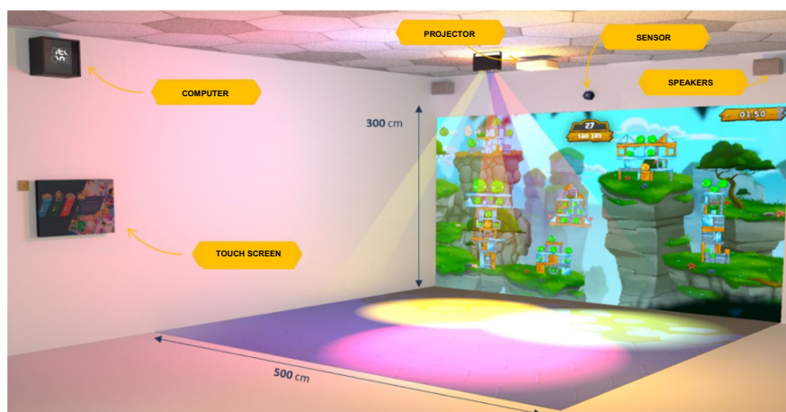
Fig. 1 Legend text: Neo One device is equipped with a projector system and wall-mounted infrared sensors and is played without a head-mounted display or other equipment. Games are selected via a remote touch screen connected to a computer. Speakers are used to play the music