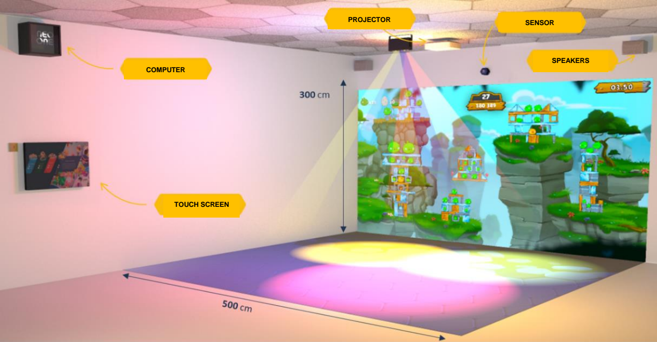
Figure 1. Neo One device