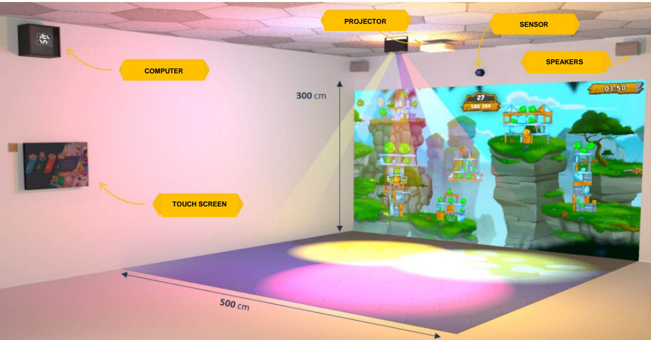
Figure 1. Neo One device