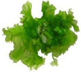
Green Seaweed Ulva lactuca