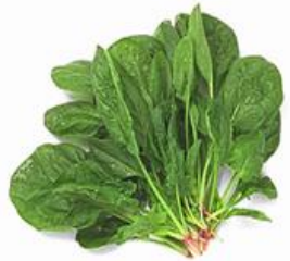
Spinach Spinacia oleracea