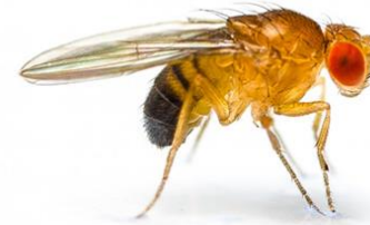
Fruit fly Drosophila melanogaster