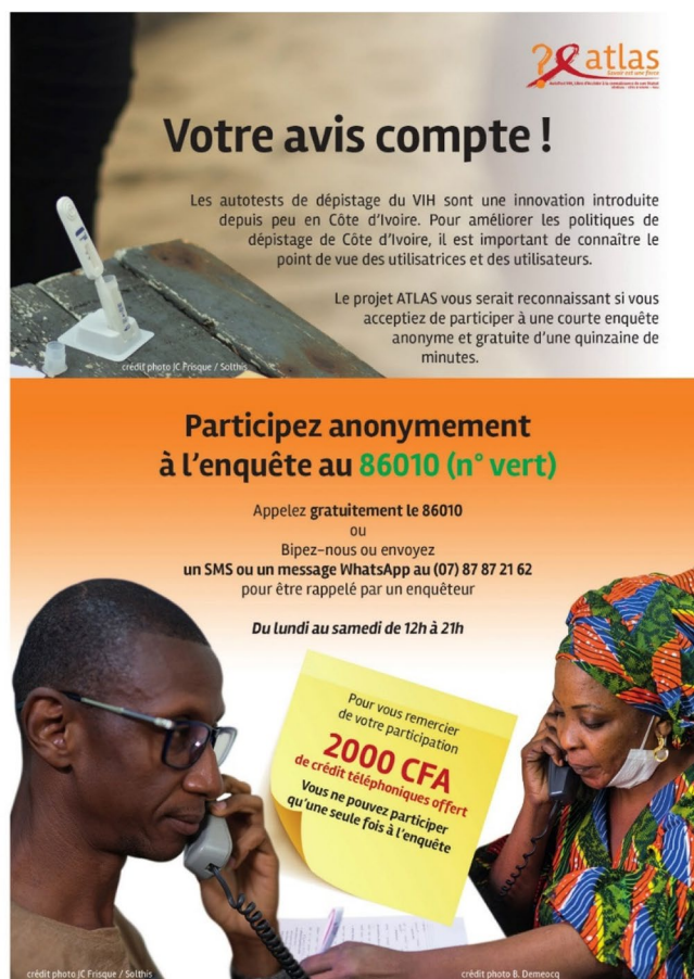
Fig. 3 Recto of the leaflet distributed with HIVST kits to invite users to participate in the survey (Ivorian version)

therefore be considered anonymous according to the European General Data Protection Regulation. All procedures were described in a publicly available data management plan ( https://dmp.opidor.fr/plans/3354/export.pdf ).