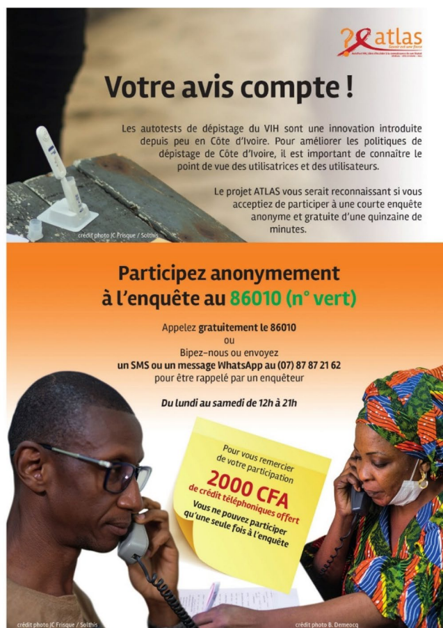
Fig. 3 Recto of the leaflet distributed with HIVST kits to invite users to participate in the survey (Ivorian version)

therefore be considered anonymous according to the European General Data Protection Regulation. All procedures were described in a publicly available data management plan ( https://dmp.opidor.fr/plans/3354/export.pdf ).