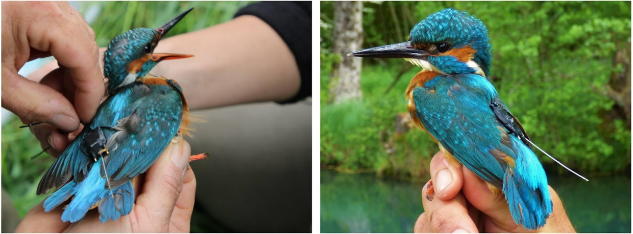
Figure 1: Equipping a European Kingfisher ( Alcedo atthis ) with a miniaturised and waterproof GPS archival tag to assess home range features. Details in Musseau et al. , 2021.