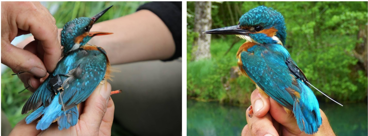
Figure 1: Equipping a European Kingfisher ( Alcedo atthis ) with a miniaturised and waterproof GPS archival tag to assess home range features. Details in Musseau et al., 2021.