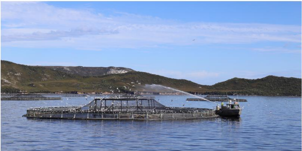
Fig.2. Fish cages in Macquarie Harbour

For the Tasmanian ecosystem, Atlantic salmon is an alien invasive species. The fact of this invasive species being crammed into sea-cages for fast fattening makes them no less invasive. Tonnes of fish-feed pellets are tossed into Macquarie Harbour on a daily basis (>10,000 tonnes pa). Blanketing the harbour floor under the cages is fish-food waste (pellets not consumed as they sink), along with tonnes of fish faeces. This putrid blanket of muck sucks oxygen from the water and creates dead zones. The Australian Government has identified: “The primary threat to the Maugean skate is habitat degradation resulting from sustained reduction of dissolved oxygen ... the most important anthropogenic contributor to the oxygen debt in Macquarie Harbour is ongoing salmonid aquaculture” [3, p.14].