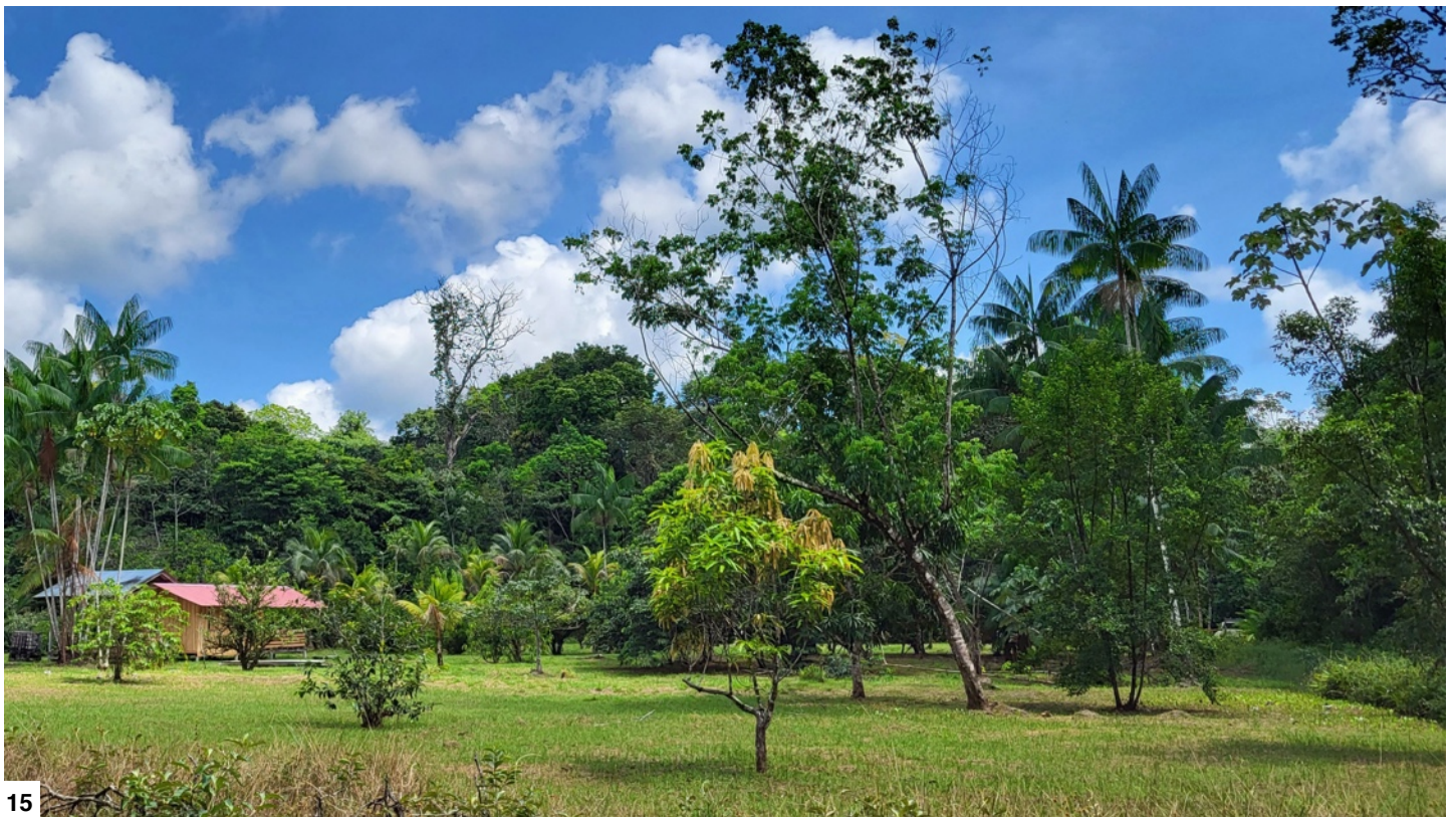
Fig. 15. Habitat of Charinus lalylaurarum sp. n. in Crique Marguerite, French Guiana.