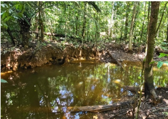
Illustration de la couverture :