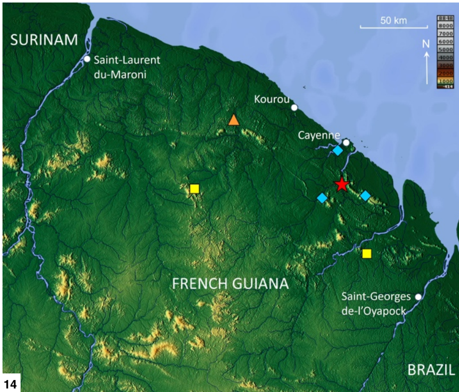
Fig. 14. Topographic map of northern French Guiana showing the known distribution of the four Charinus species recognized to occur in the department: