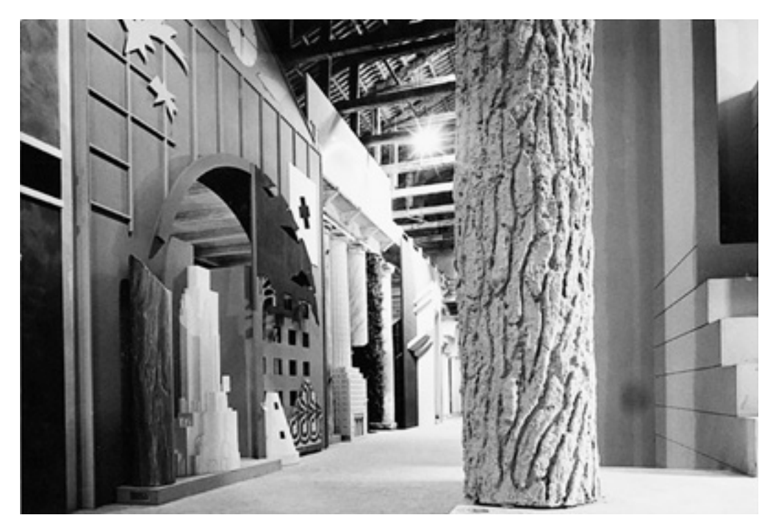
Paolo Portoghesi, photograph of Josef Paul Kleihues' facade for Strada Novissima, 1980 MAXXI Museo nazionale delle arti del XXI secolo, Roma. MAXXI Architettura Collection. Paolo Portoghesi Archive

coins the term "eagle principle," "which simultaneously implodes the idea of an aesthetic medium and turns everything equally into a 'readymade' that collapses the difference between the aesthetic and the commodified."<sup>7</sup> Reflecting upon its consequences, she adds, "twenty-five years later, all over the world, in every biennial and at every art fair, the eagle principle functions as the new Academy."8 In this sense, the elaborations of philosopher Félix Guattari on the post-(mass) media era of the 1990s<sup>9</sup> or of theorists Lev Manovich and Peter Weibel on the post-media aesthetics<sup>10</sup> in the 2000s must be understood as critical extensions of this paradigm shift with a larger emphasis on the digital turn whose historical process has only increased the intersections between art, film, and design in recent years.