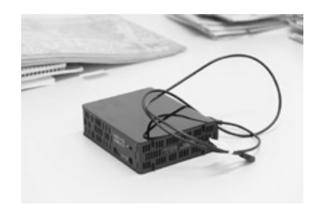
MVRDV's hard drive at Het Nieuwe Instituut, Rotterdam, 2015

For architecture, this means that all technologically enabled actors participate in a process of collective design. On social networks, the role of the curator has taken precedence over that of the creator. Icons are assembled