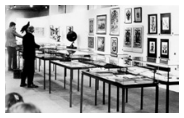
Marcel Broodthaers, Museum of Modern Art Department of Eagles, 1968. Installation view

That Broodthaers was an artist mobilizing his discourse through space installations matters significantly for the capacity of space to actively merge artistic and curatorial practices, instead of just being a neutral background. From 1968 to 1975 Broodthaers produced