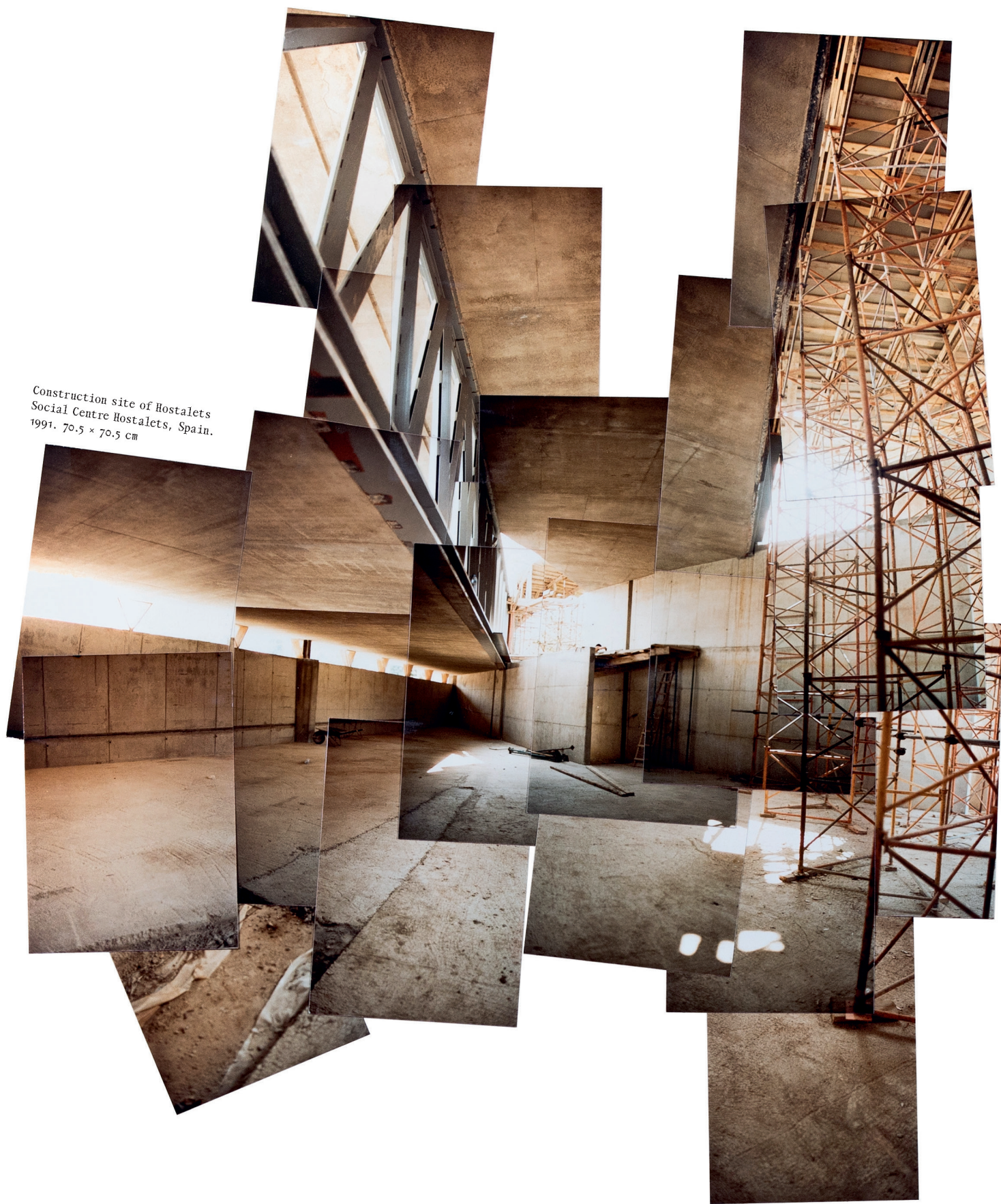
Construction site of Hostalets Social Centre Hostalets, Spain. 1991. 70.5 x 70.5 cm