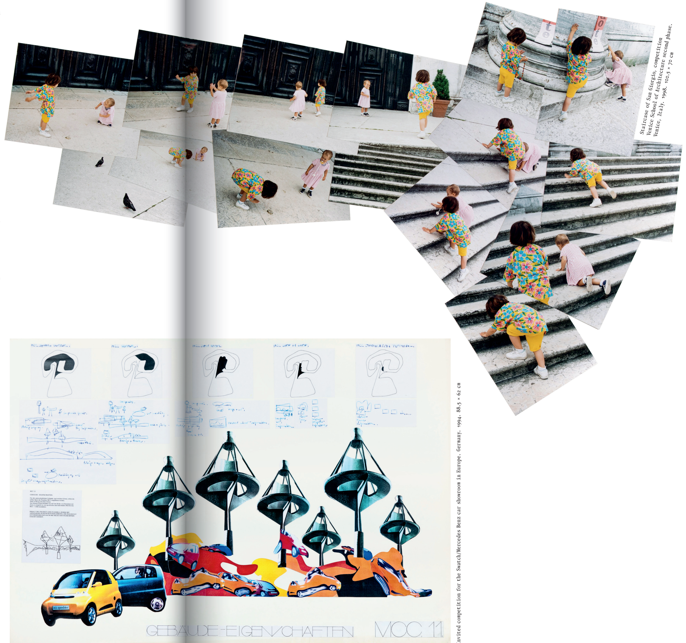
Staircase of San Giorgio, competition Venice School of Architecture second phase, Venice, Italy, 1998. 100.5 x 70 cm

BT It changed in time. At the very beginning, the idea was to apply Hockney's technique to document architecture, but then it became a way of explaining a project. You have to remember how difficult it was to enter a competition at the time. It was very