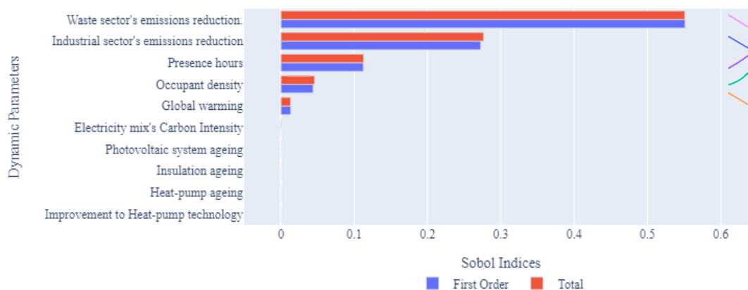
Figure 2. Results from the Sobol SA for the case study. The graphic shows the first-order and total Sobol indices. The squiggles to the right of the bar plot represents the tendency of the output for the respective parameters.

In Figure 3, we compared the overall GWP of three levels of dynamisms: no dynamics or static; a hybrid approach, where only the five main DPs identified in Figure 2 and finally with all ten parameters. Since the results of DLCA are scenario-dependant, there will be maximum and minimum values. These values were simple to find, thanks to the aforementioned linearity. From this comparison we notice that the extra parameters added parameters less than 1 tCO 2 -eq to the range of possible values.