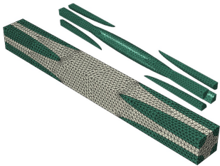
(a) \mathbf{p}_0 : \text{vf} = 0.35 , \text{ar} = 10