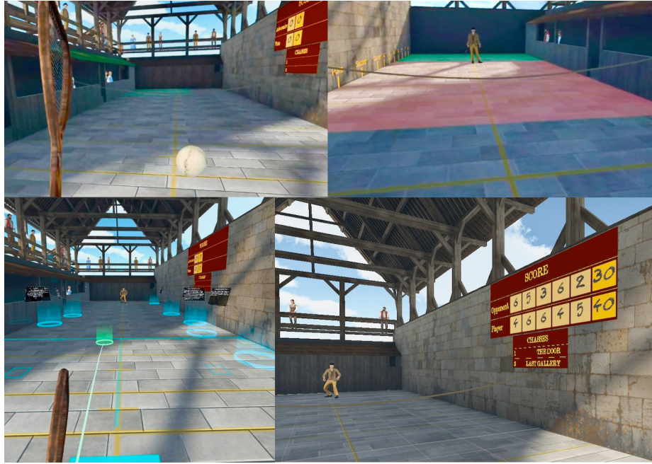
Fig. 3. Top, Left: Service training, Right: Chase Training, Bottom, Left: Guided visit, Right: Score display.

first success. The chase area to win is highlighted on the court. At the end of this tutorial phase, a visit of the site is proposed, with teleportation to explanation panels, and the visitor has also the possibility to play a complete match.