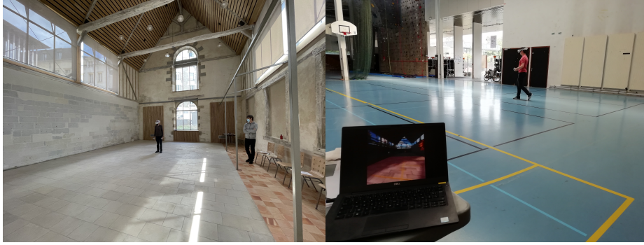
Fig. 5. User study in (left) the original building, and (right) a modern gymnasium.