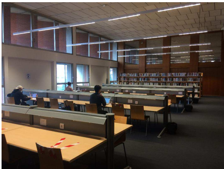
Toulouse University Library