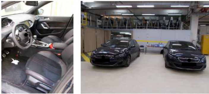
Shared cars