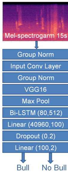
Figure 3: Architecture of CRNN model by combining VGG16 model and Bi-LSTM recurrent layer.

The architecture of the deep learning model was designed by combining CNN and RNN networks to create a CRNN. For CNN we used a pretrained model called VGG-16 [11] to extract complex features from images. A Bidirectional-Long-Short-Term-Memory (Bi-LSTM) layer is used for the recurrent part.