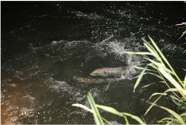
Figure 1: Splashes called “bull” form migratory fish during spawning in rivers.

In this paper, we present the details of our CRNNs approach for bull sound detection, discussing the architecture, training methodology, and performance evaluation.