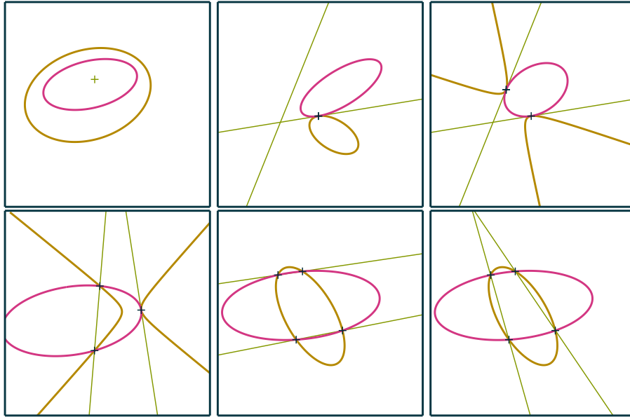
Fig. 2. Extraction of 0,1,2,3 and 4-intersections where the green curve is the degenerate conic, which can be a line pair or a point. The 4-intersection is depicted twice with different line pairs.

return conic_line_inter ( C_{\perp}, \alpha_1, w_1 ) \cup conic_line_inter ( C_{\perp}, \alpha_2, w_2 )