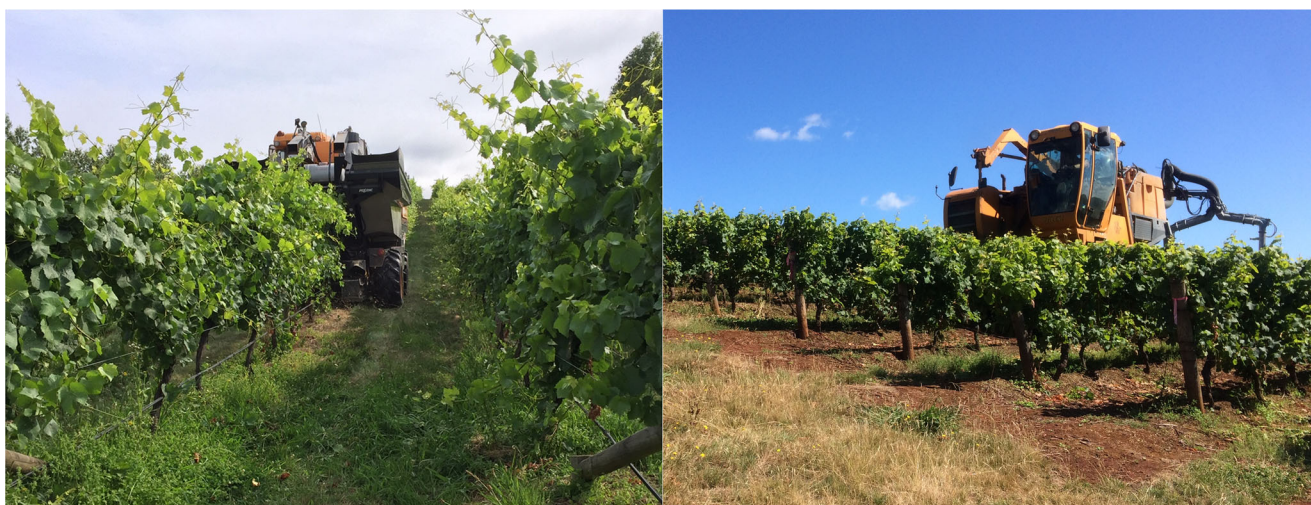
Fig. 1 Collaborative trials where vineyard staff applied treatments using their own equipment.

The authors collaborated with four wine businesses in three states of Australia on vineyard trials (Table 1) using a participatory approach (Carberry 2001). In each case, the grower set the objectives for the trial (Table 1). The authors worked with the growers and consultants as equal partners from trial design