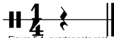
Figure 5.1: quarter note rest.

Musical silence could be understood as the lack of pulse due to the fact that the interpretation of musical silence is assumed as the absence of a rhythmic figure (Schoenberg, 2016; Kania, 2010; Margulis, 2007). Therefore, it is stated that there is no pulse, so, musical silence could be considered to be mathematically represented when \beta = 0 b, instead, a paradox arises at the moment of remembering the existence that there are different musical silences, since although all silences are worth \tilde{t} = 0 , the fact that each of them lasts different time causes that they are not equal, let see an example, \tilde{t}_1 in score it follows that: