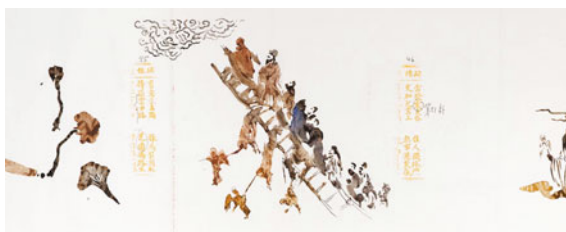
Fig. 3 Qian , 2012, Water colour on rice paper and collages. Artist: Huang Yongping