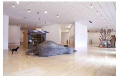
Fig. 2 The Market of Punya of 2007, Multimedia, variable dimensions. Artist: Huang Yongping

At the opposite angle of the room, is a long roll of watercolours on rice paper, called Qian , in pinyin with no accent. It shows angels on a flying ladder, some being pushed into the void by devils with forks. It emulates Taoist paintings such as the Investiture of a Daoist Deity , dated 1641, from the Metropolitan museum, in which local divinities are presented to the Jade Emperor to be accepted within the official Pantheon accompanied by mythological birds, symbols of renewal. It also