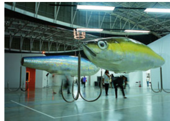
Fig. 4 Huang Yongping Two Baits , 2001, Iron, fiberglass, metal sheets, 1200 × 800 × 300 cm. Installation view at Rockbund Museum, Shanghai, 2012