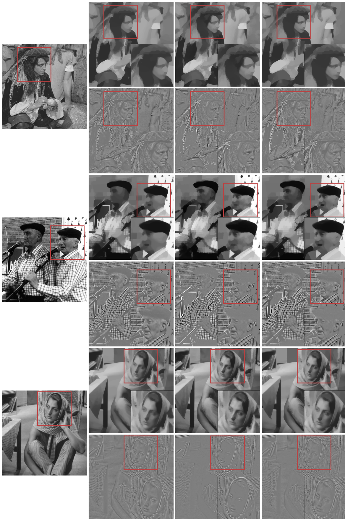
Fig. 2: Comparison between different methods. From left to right: original image, LPR, BNN and our proposed method.