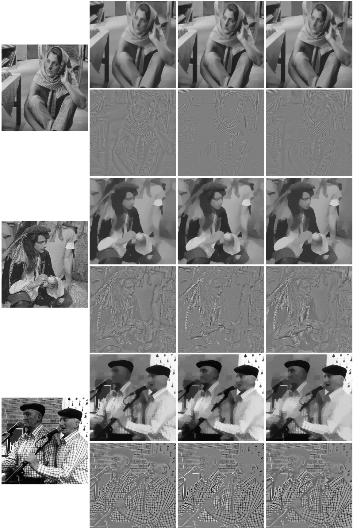
Fig. 2: Comparison between different methods. From left to right: original image, LPR, BNN and our proposed method.