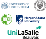
Fig. 3 (above) Academic partners involved from Austria, France, Germany, Italy and United Kingdom