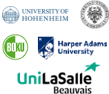
Fig. 3 (above) Academic partners involved from Austria, France, Germany, Italy and United Kingdom