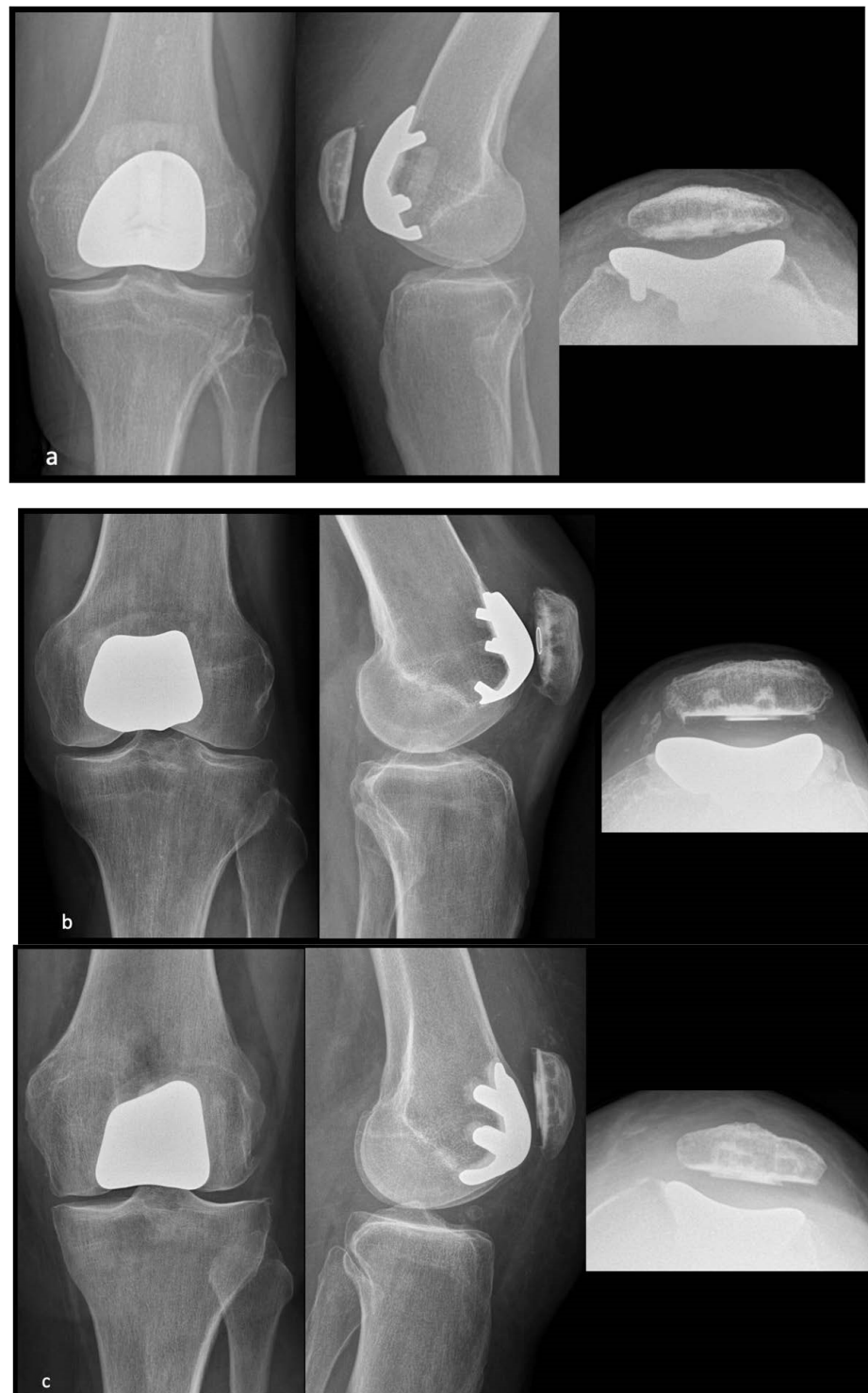
Figure 1. Postoperative radiographs of PFA performed conventionally (only implant) (a), with an image-free robotic system (only implant) (b) and with an image-based robotic system (inlay implant) (c).