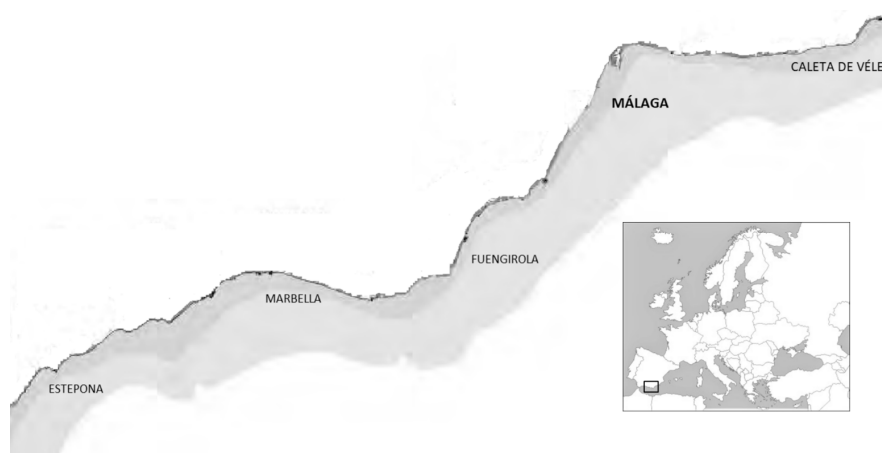
Figure 1. Map of the four Malaga Cofradias.

The Andalusian coastline, and in particular the “Costa del Sol”, represents one of the most popular tourist destinations in the entire Mediterranean Sea hosting a wide range of activities strictly dependent on the good quality of marine water and the landscape. Fisheries, in particular, are considered the most relevant traditional and cultural coastal activity contributing to the local food provision and are an added value for tourism. The area of the present study, the Malaga province, includes four fishery Cofradias: Estepona, Marbella, Fuengirola, and Caleta de Vélez (Figure 1). Here, fisheries, marine tourism, and aquaculture share the use of the coastal waters and port facilities but, while fisheries and tourism have coexisted in the area since the first decade of the XX century [20], aquaculture is more recent and it is struggling to be integrated into the existing social, economic and institutional context [18].