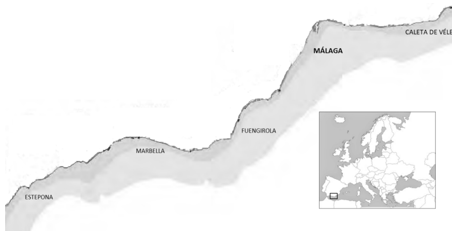
Figure 1. Map of the four Malaga Cofradias.

The Andalusian coastline, and in particular the “Costa del Sol”, represents one of the most popular tourist destinations in the entire Mediterranean Sea hosting a wide range of activities strictly dependent on the good quality of marine water and the landscape. Fisheries, in particular, are considered the most relevant traditional and cultural coastal activity contributing to the local food provision and are an added value for tourism. The area of the present study, the Malaga province, includes four fishery Cofradias: Estepona, Marbella, Fuengirola, and Caleta de Vélez (Figure 1). Here, fisheries, marine tourism, and aquaculture share the use of the coastal waters and port facilities but, while fisheries and tourism have coexisted in the area since the first decade of the XX century [20], aquaculture is more recent and it is struggling to be integrated into the existing social, economic and institutional context [18].