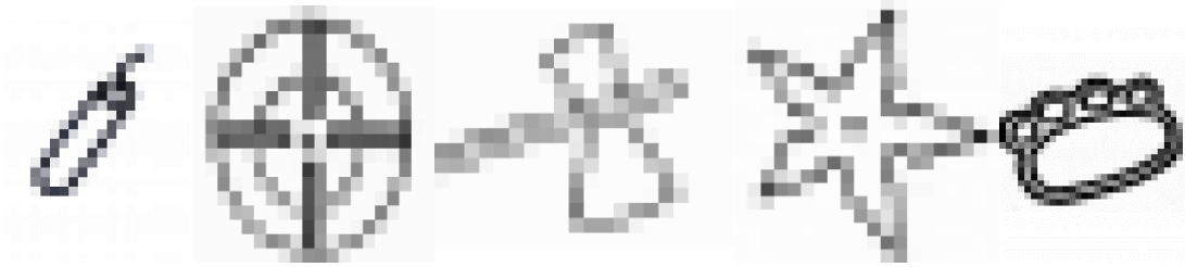
Figure 2: Blurred stimuli that could be perceived as weapons (e.g. from left to right, dynamite, target, axe, ninja star, brass knuckles) or not (candle, buoy, broom, star, ring etc.)

was presented for 3000 ms and then the participants had to enter a free response using the keyboard. After this task, the participants were finally debriefed and thanked.