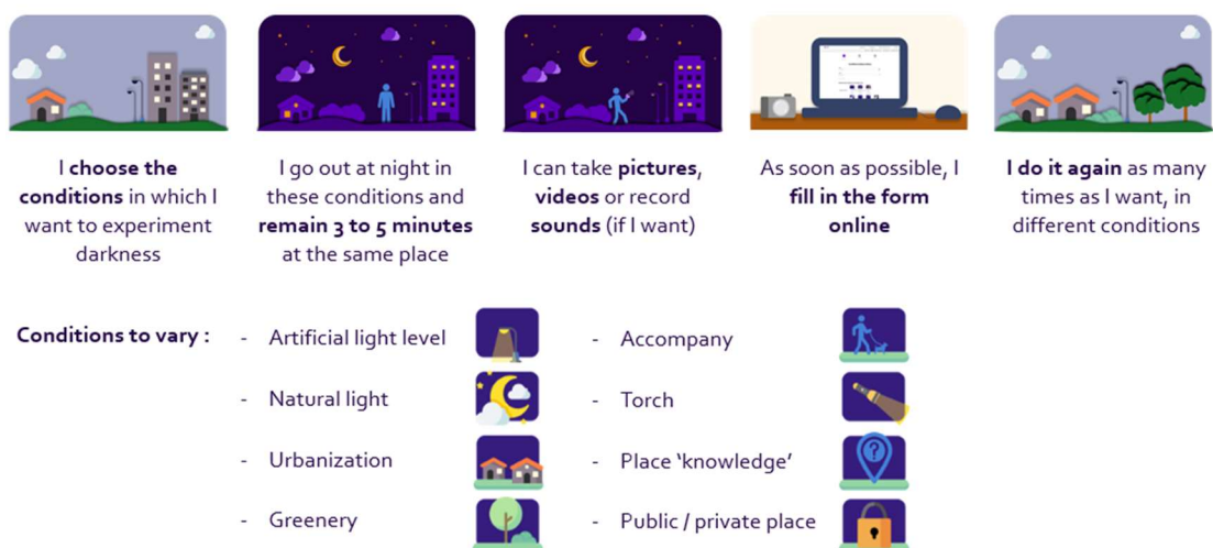
Figure 2. Citizen science protocol, as presented to the participants in the platform.