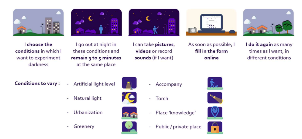
Figure 2. Citizen science protocol, as presented to the participants in the platform.