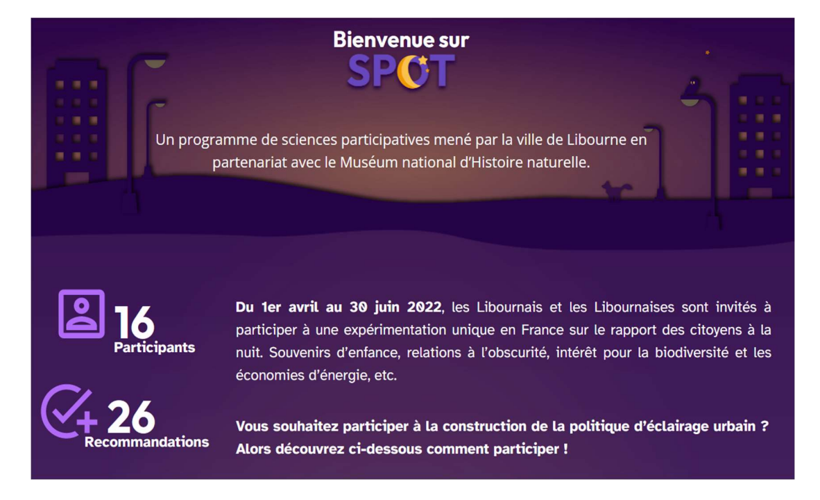
Figure 1. Homepage of the SPOT online platform for Libourne.

participate, inhabitants then create an account, and they are clearly told the ethical rules which apply regarding their data, in particular: data are totally anonymized (participants create a pseudo and there is no possibility to identify them behind their contribution); data are stored during 5 years exclusively by the research team; participants can delete their registration at any time; and they can give their consent for being contacted by e-mail by members of the research team. They are also told that anyone (municipality, inhabitants who did not participate...), anytime, can access all participants' contributions (childhood memories, observations, questions, comments, and recommendations) under their pseudonymized or anonymized format.