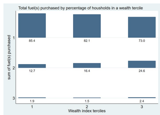
Figure 1: Total fuels purchased by the percentage of households in a wealth tercile