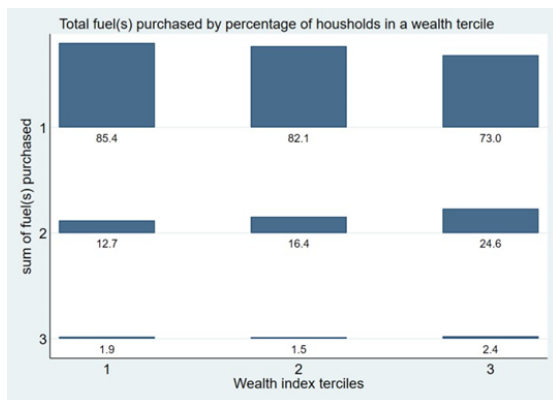
Figure 1: Total fuels purchased by the percentage of households in a wealth tercile

Source: Author's calculation from the UNPS 2019/2020 dataset