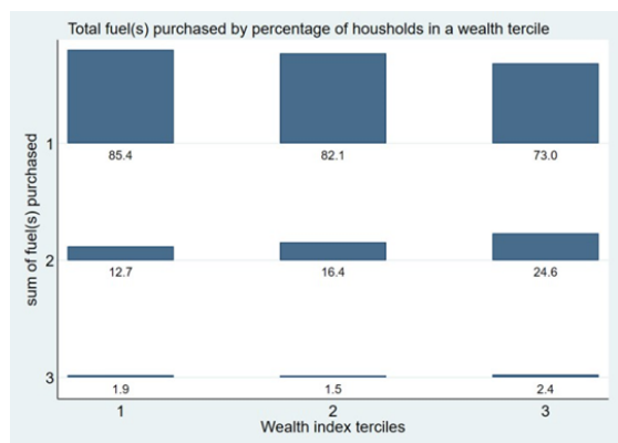
Figure 1: Total fuels purchased by the percentage of households in a wealth tercile